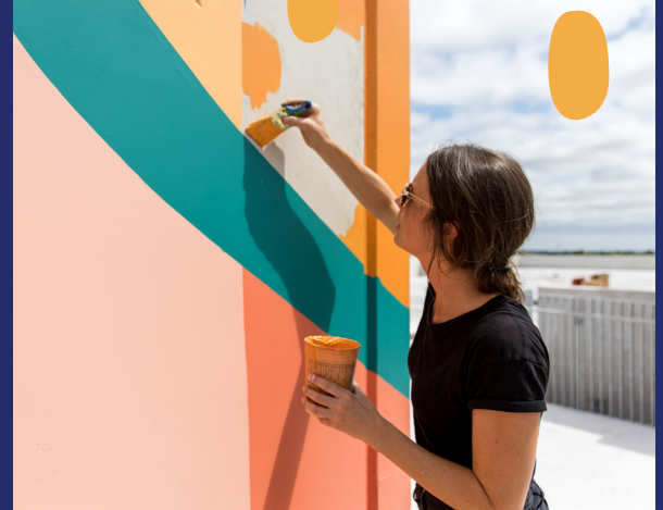
Eastbound's ode to the East Side's vibrant spirit is captured in the custom mural onsite painted by local artist, Emily Eisenhart.

From homegrown boutiques and studios to locally-crafted coffee and many of Austin's most beloved restaurants and nightspots, the East Side has it all. In a prime position between Downtown Austin and Austin-Bergstrom International Airport, Eastbound has put itself at the crossroads of what is next.