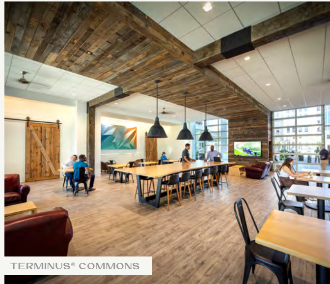
TERMINUS ® COMMONS