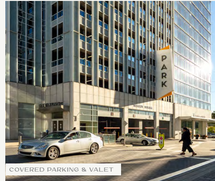
COVERED PARKING & VALET